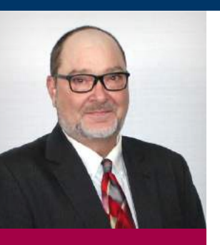
In This Issue: