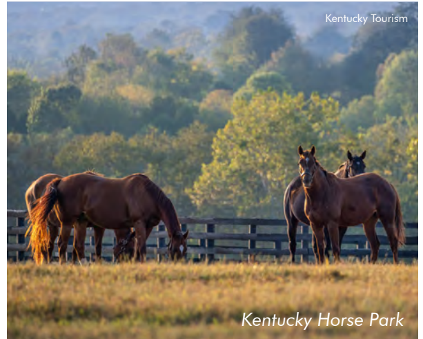
Kentucky Horse Park

This morning, journey to Lexington, known as the "Horse Capital of the World", where our day begins with a warm welcome lunch before diving into Kentucky's storied equine culture. Our first stop is Hermitage Farm , where a guided tour unveils the legacy of thoroughbred racing through historic barns, elegant competition carriages, and the chance to meet some of the farm's magnificent horses. The afternoon continues at the renowned Kentucky Horse Park , a one-of-a-kind destination that blends education and excellence. Watch captivating shows like the Hall of Champions and Parade of Breeds, meet retired racing legends, and explore the world's largest equine museum, the International Museum of the Horse, along with the American Saddlebred Museum. Back in Louisville, come together for a memorable group dinner.