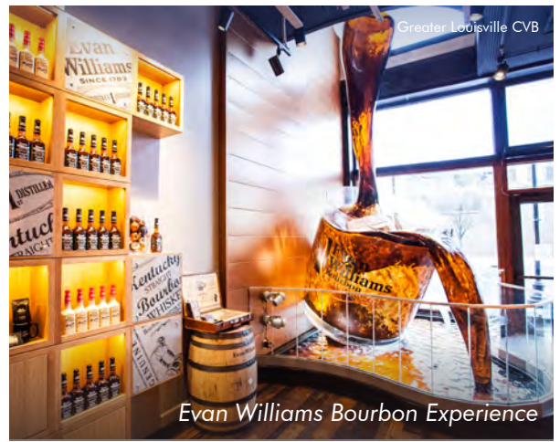
Evan Williams Bourbon Experience

Enjoy breakfast before setting out for a thrilling day as we travel south to the Corvette Museum Library & Archives , home to over eighty famous Corvettes and an expansive collection of rare books, magazines, and audiovisual treasures that celebrate the legacy of America's favorite sports car. For those craving a hands-on thrill, the museum's state-of-the-art driving simulators let us experience everything from daring road conditions to high-speed adventures. Enjoy a group lunch surrounded by these legendary machines before continuing to the mysterious Lost River Cave . Here, we'll embark on Kentucky's only underground boat tour , beginning with a guided riverside walk rich in tales of Native American life, Civil War intrigue, and outlaws like Jesse James. Then glide through the cool, echoing caverns on a boat ride past dramatic rock formations and hidden passages. We'll return to Louisville in the evening and enjoy dinner on our own.