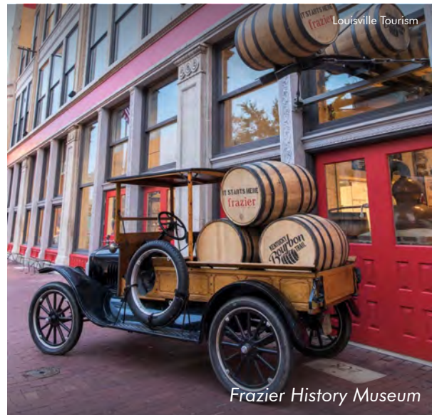
Frazier History Museum

Today marks the beginning of your journey home, but not before one final inspiring experience in Louisville. After checking out of our hotel, we'll venture into a powerful guided tour of the Muhammad Ali Center , where the life and legacy of "The Greatest" come vividly to life, from his early days in Louisville to his rise as a boxing legend and global humanitarian. After enjoying lunch on your own, it's time to bid farewell to this soulful city. In the late afternoon, arrive in Peoria, IL , to check into our hotel and gather for a delicious farewell dinner.